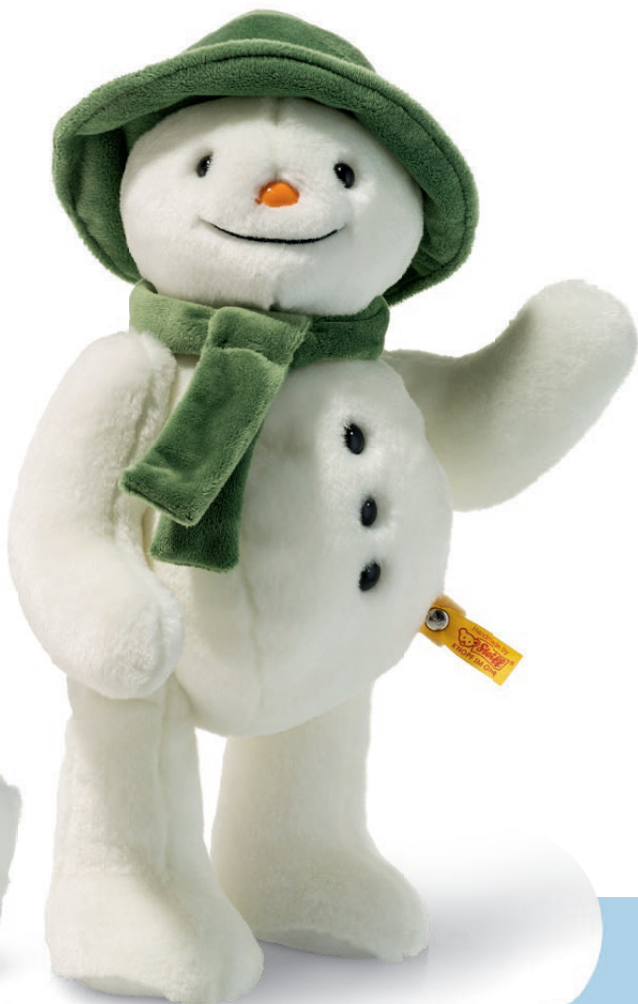
The Snowman | 690181 | 27 CM