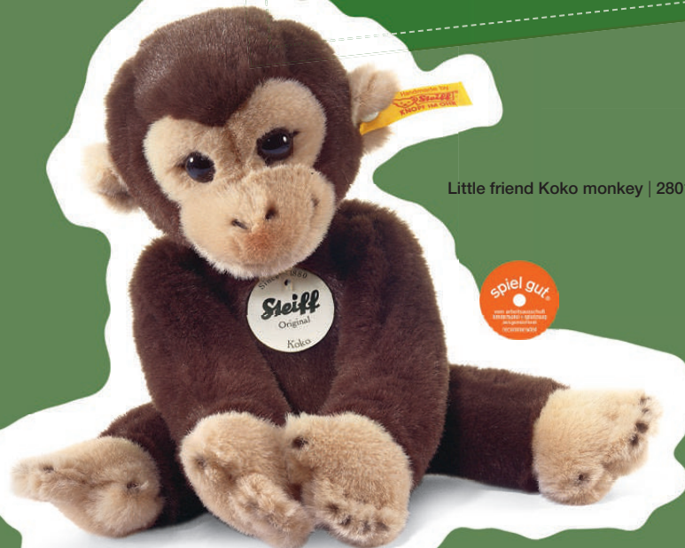
Little friend Koko monkey | 280122 | 25 CM