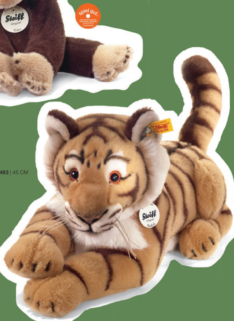
Radjah tiger | 064463 | 45 CM