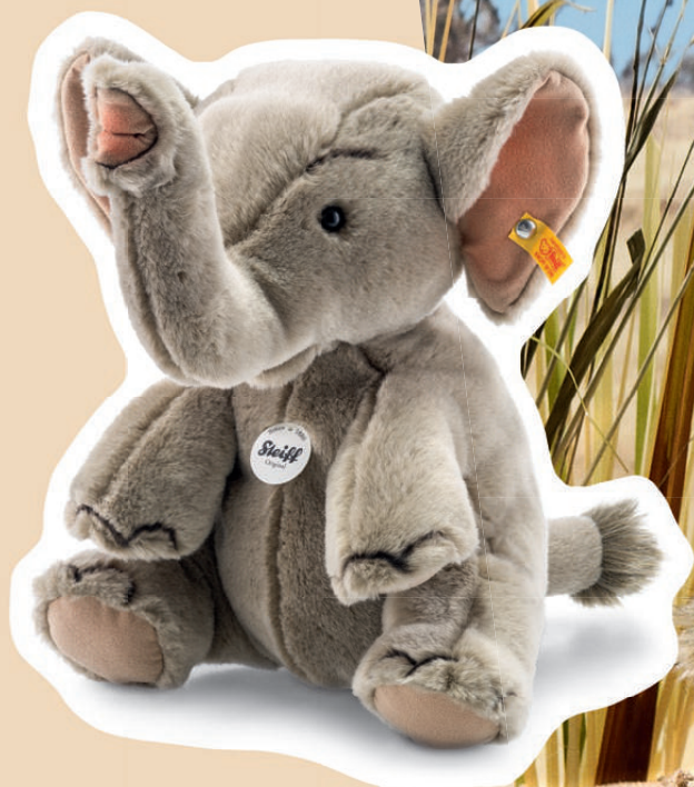
Hubert elephant | 064579 | 30 CM